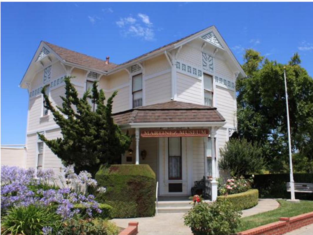
The Borland Home houses the Martinez Museum which is operated by the Martinez Historical Society at 1005 Escobar Street in Martinez. The home will be welcoming visitors from 10 am to 4 pm on Saturday October 8th, the day of the Martinez Home Tour.