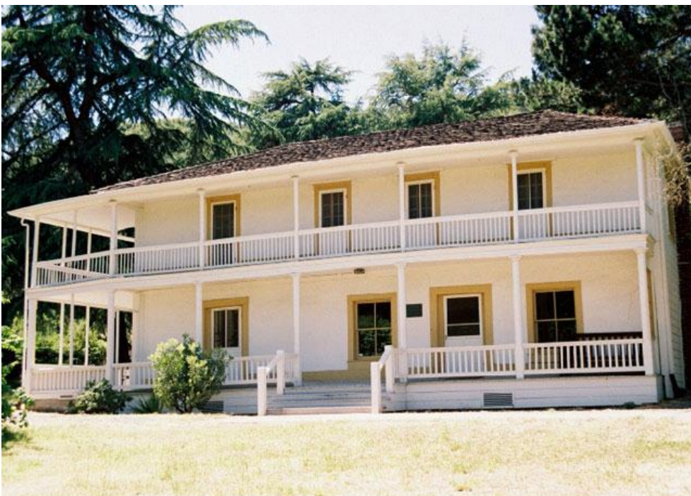
The Martinez Adobe is one of the small number of structures in California dating back to Statehood and beyond. Constructed circa 1849, the building has been seismically retrofitted, and should now last the ages. It is currently displaying the first full scale exhibit on the historic de Anza Trail.