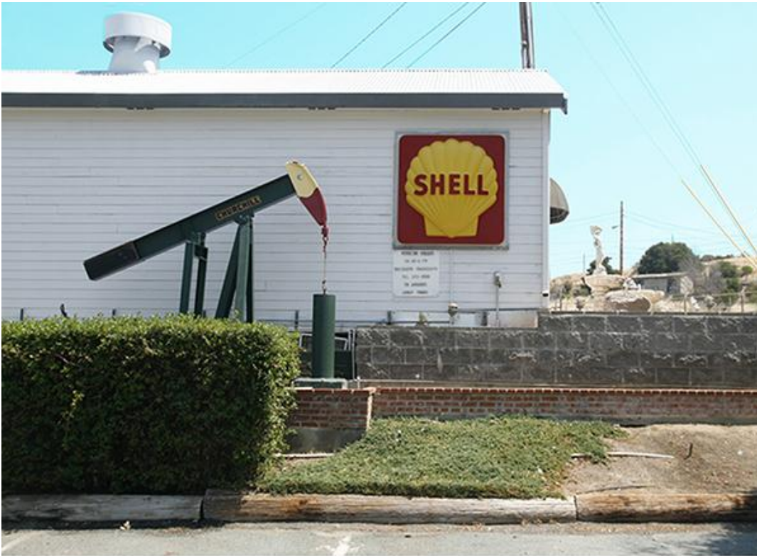
The Shell Oil Museum is located near the Shell Clubhouse in Martinez. The Museum depicts the history of oil refining in Martinez – beginning with the construction of the Shell Refinery in 1915. The Museum is staffed by docents who are retired Shell employees.