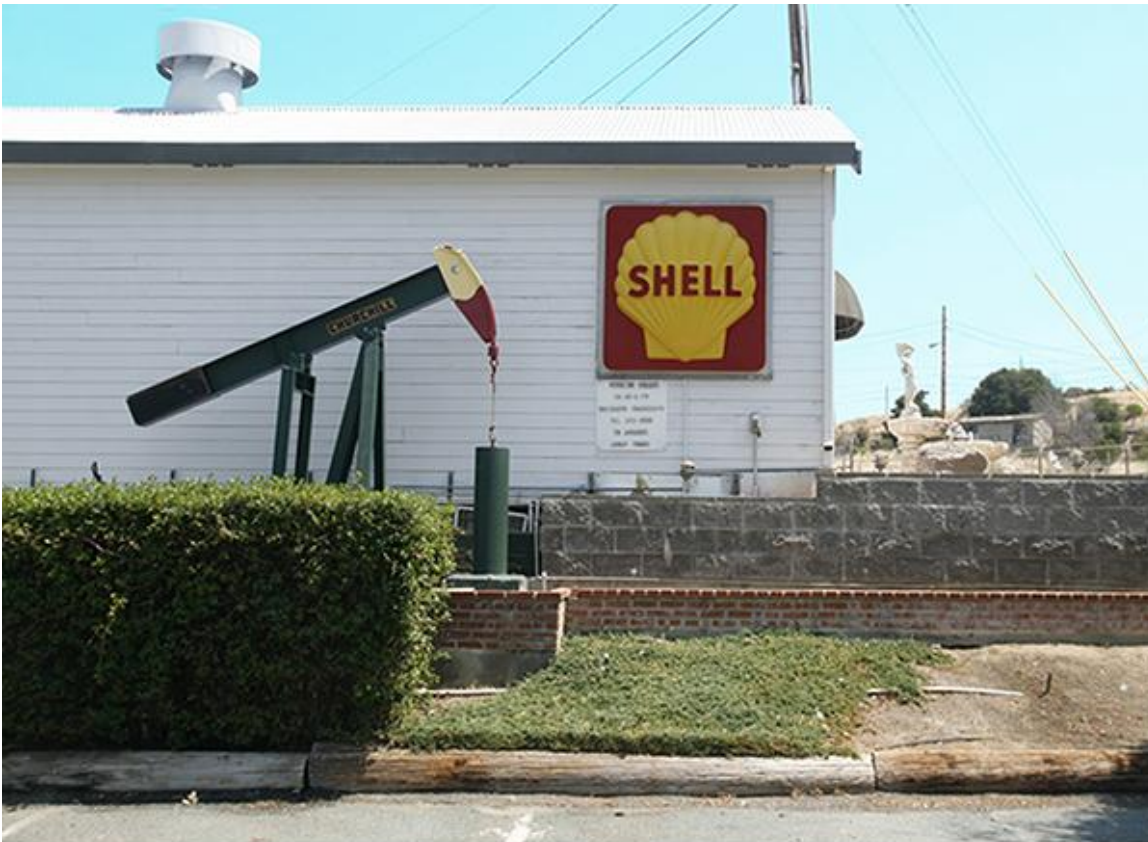
The Shell Oil Museum is located near the Shell Clubhouse in Martinez. The Museum depicts the history of oil refining in Martinez -- beginning with the construction of the Shell Refinery in 1915. The Museum is staffed by docents who are retired Shell employees.