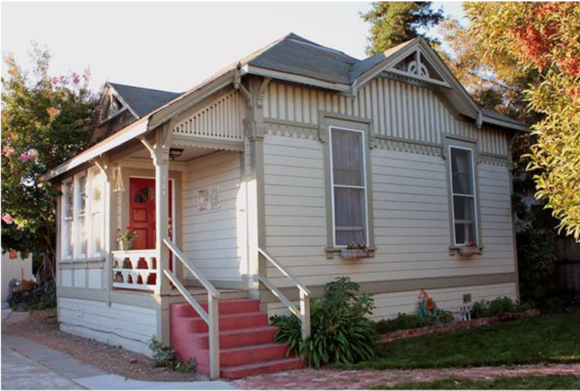
This Victorian Cottage is directly across the street from the stone & brass monument honoring Martinez as the birthplace of the Martini. Since its inclusion on the 2010 Home Tour, this home has been partially remodeled and features an expanded collection of Martini art and musical instruments (the owners are musicians).