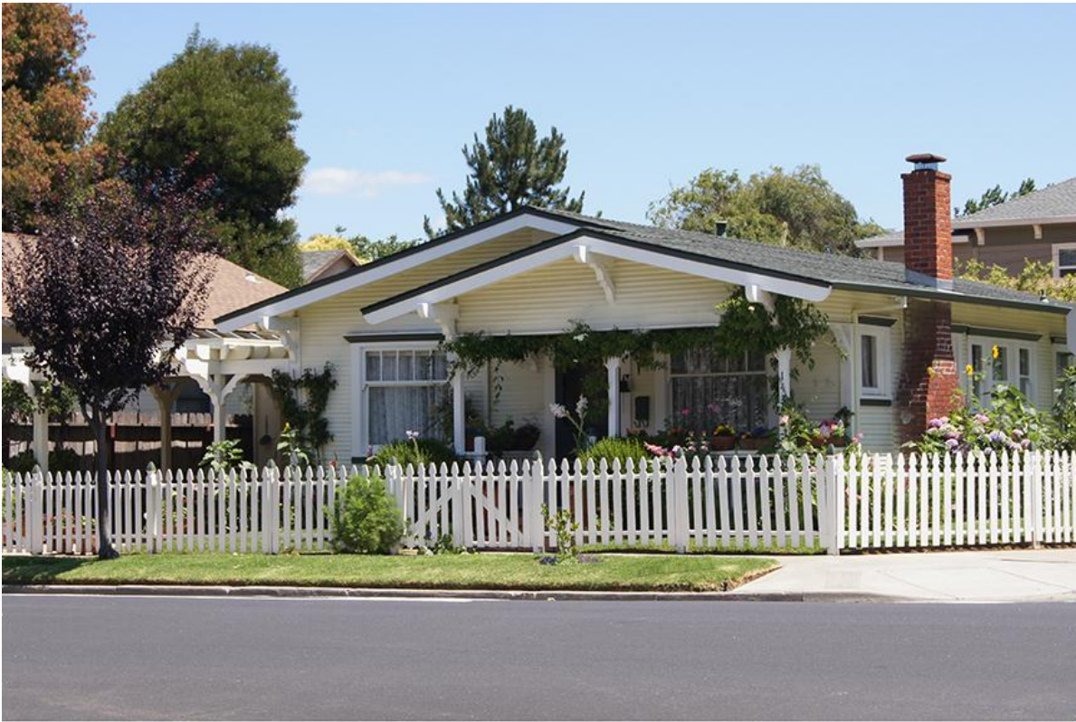
This 1920's Craftsman home on busy Alhambra Avenue is famous in Martinez because the owner cultivates a garden that is bursting with flowers every month of the year -- both in the highly visible front yard -- and in the private patio which can be seen during the Martinez Home Tour.