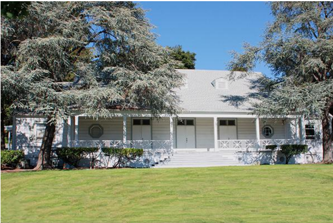
The Martinez Home Tour begins at the Shell Clubhouse which is located at 1635 Pacheco Boulevard on the edge of downtown Martinez. The Clubhouse still retains its 1937 Craftsman interior, original woodwork (including ceiling beams, paneling and decorative details), light fixtures and hardware.