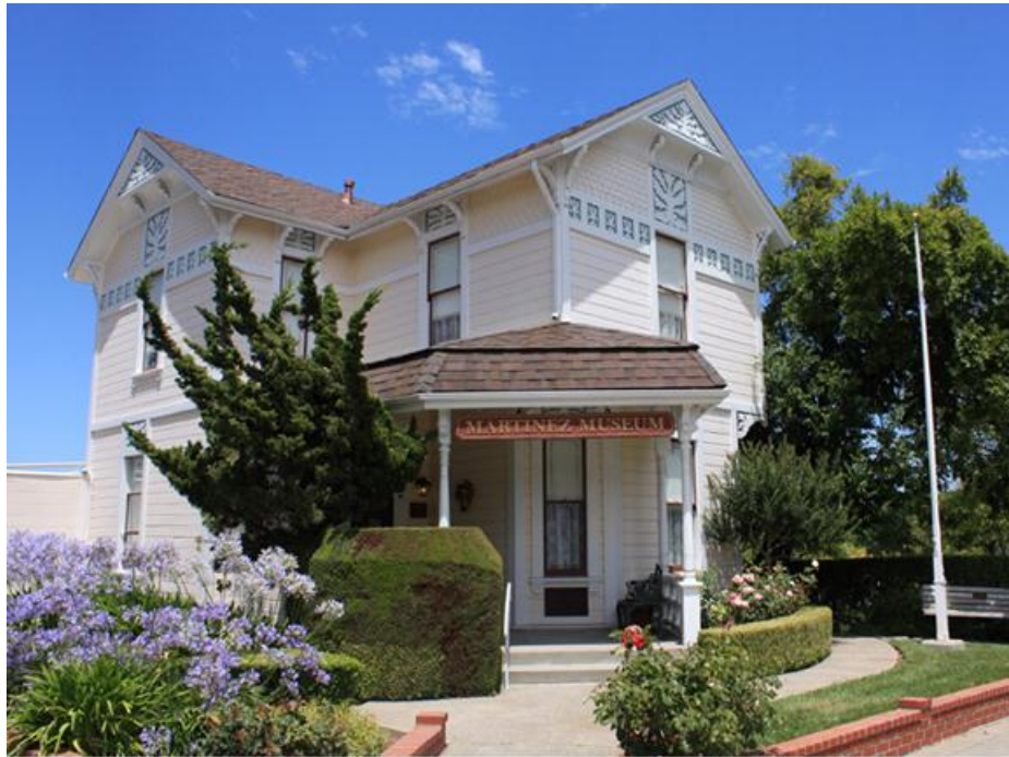
The Borland Home houses the Martinez Museum which is operated by the Martinez Historical Society at 1005 Escobar Street in Martinez. The home will be welcoming visitors from 10 am to 4 pm on Saturday October 8th, the day of the Martinez Home Tour.