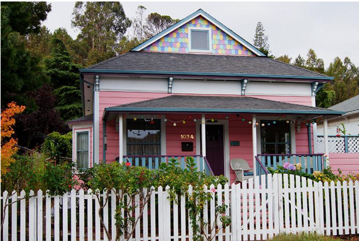
Owned by a knitter, visitors to the Victorian cottage during the Martinez Home Tour will be greeted with shelves of colorful yarn used in the owner's craft. The home's cheerful color scheme includes fish scale shingles in the gable painted in a variety of pastel shades.