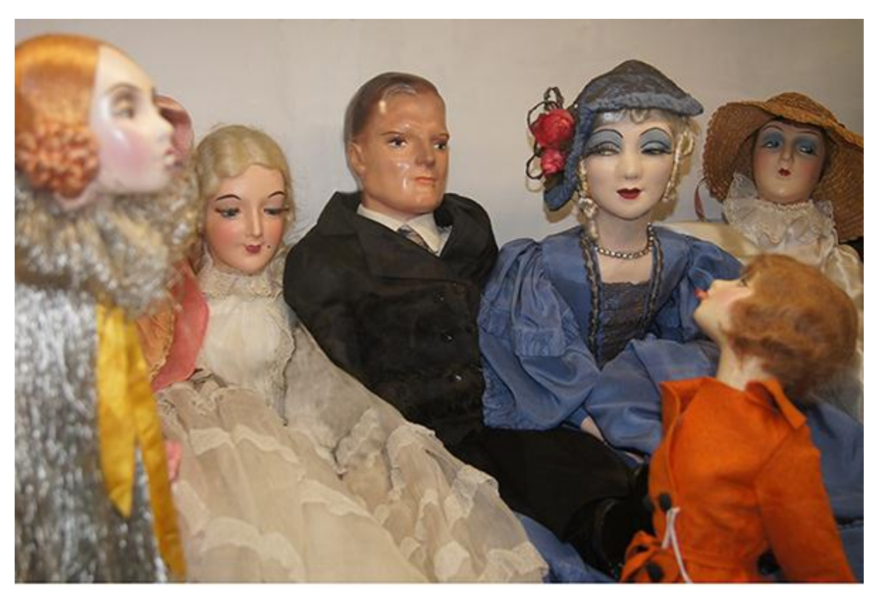
An additional point of interest on the Martinez Home Tour will be the "Doll Hospital" at 1616 Alhambra Avenue where dolls are repaired, displayed and doll-making classes are conducted.