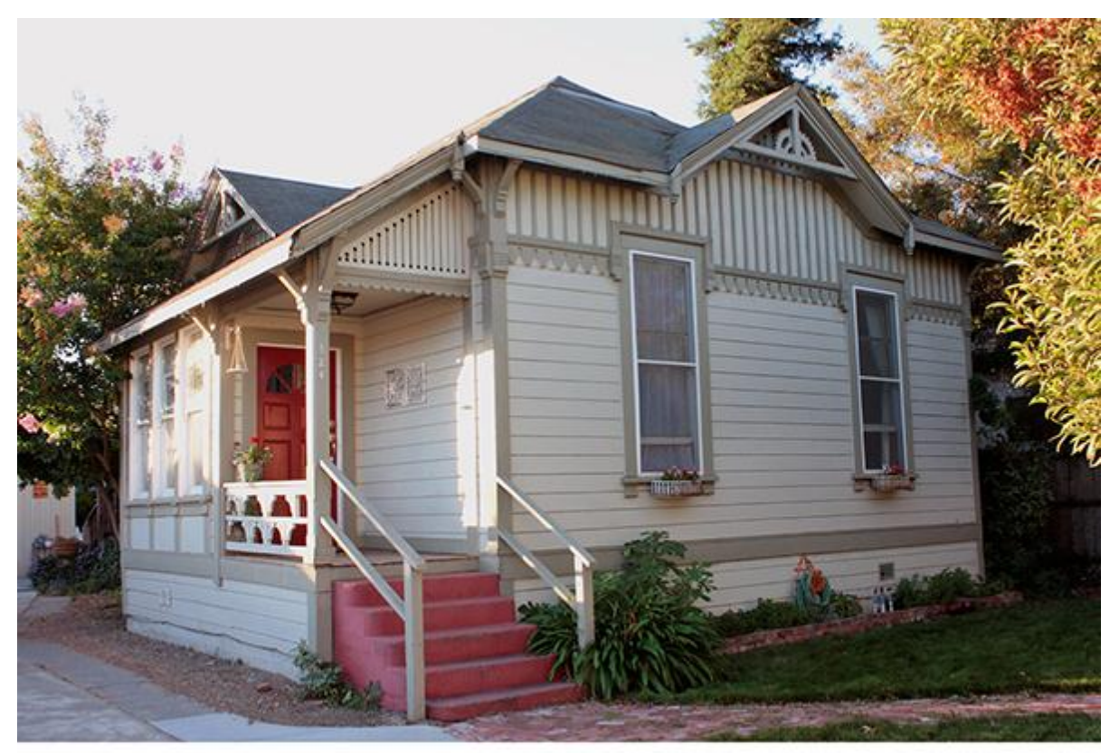
This Victorian Cottage is directly across the street from the stone & brass monument honoring Martinez as the birthplace of the Martini. Since its inclusion on the 2010 Home Tour, this home has been partially remodeled and features an expanded collection of Martini art and musical instruments (the owners are musicians).