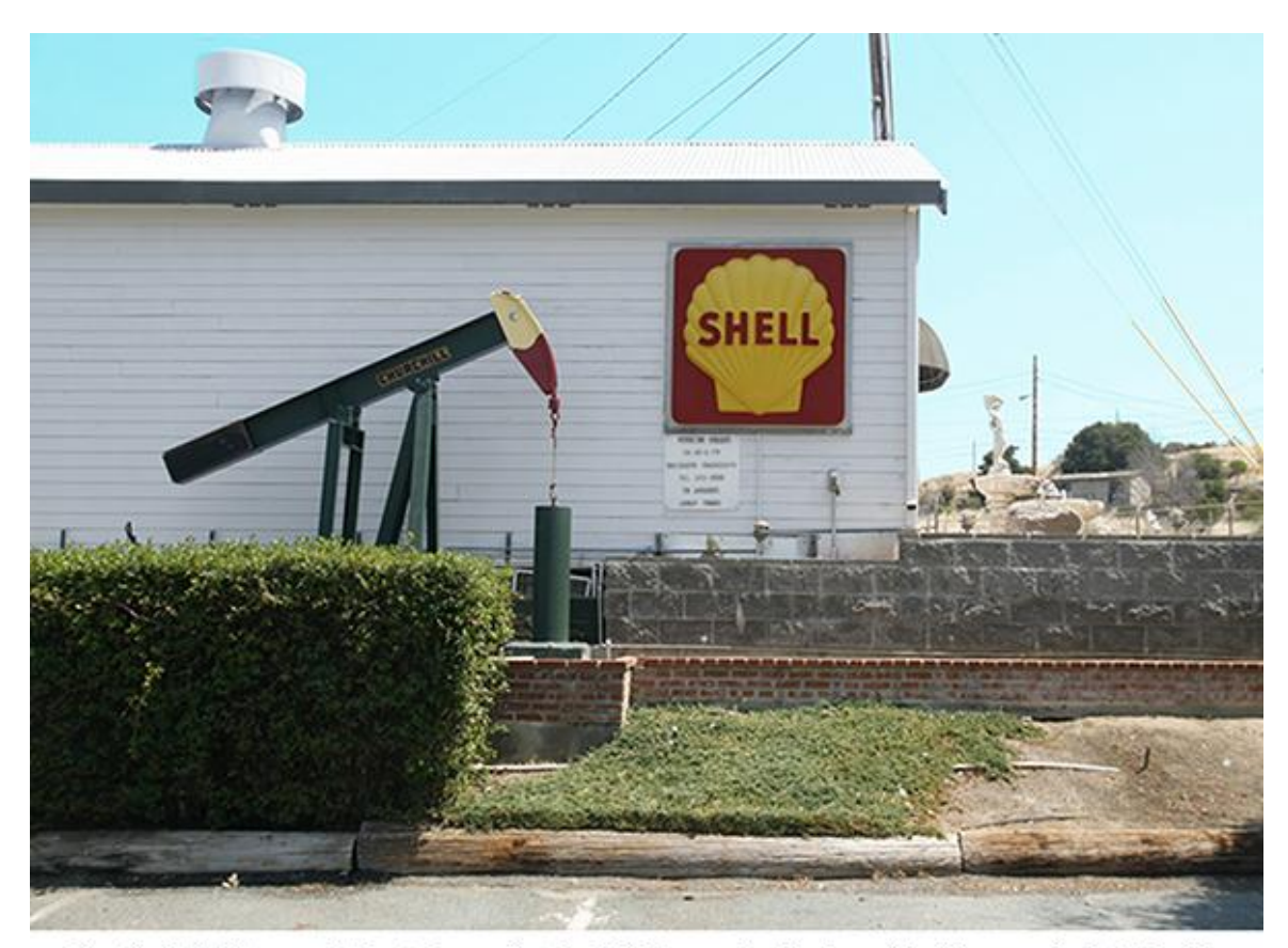
The Shell Oil Museum is located near the Shell Clubhouse in Martinez. The Museum depicts the history of oil refining in Martinez -- beginning with the construction of the Shell Refinery in 1915. The Museum is staffed by docents who are retired Shell employees.