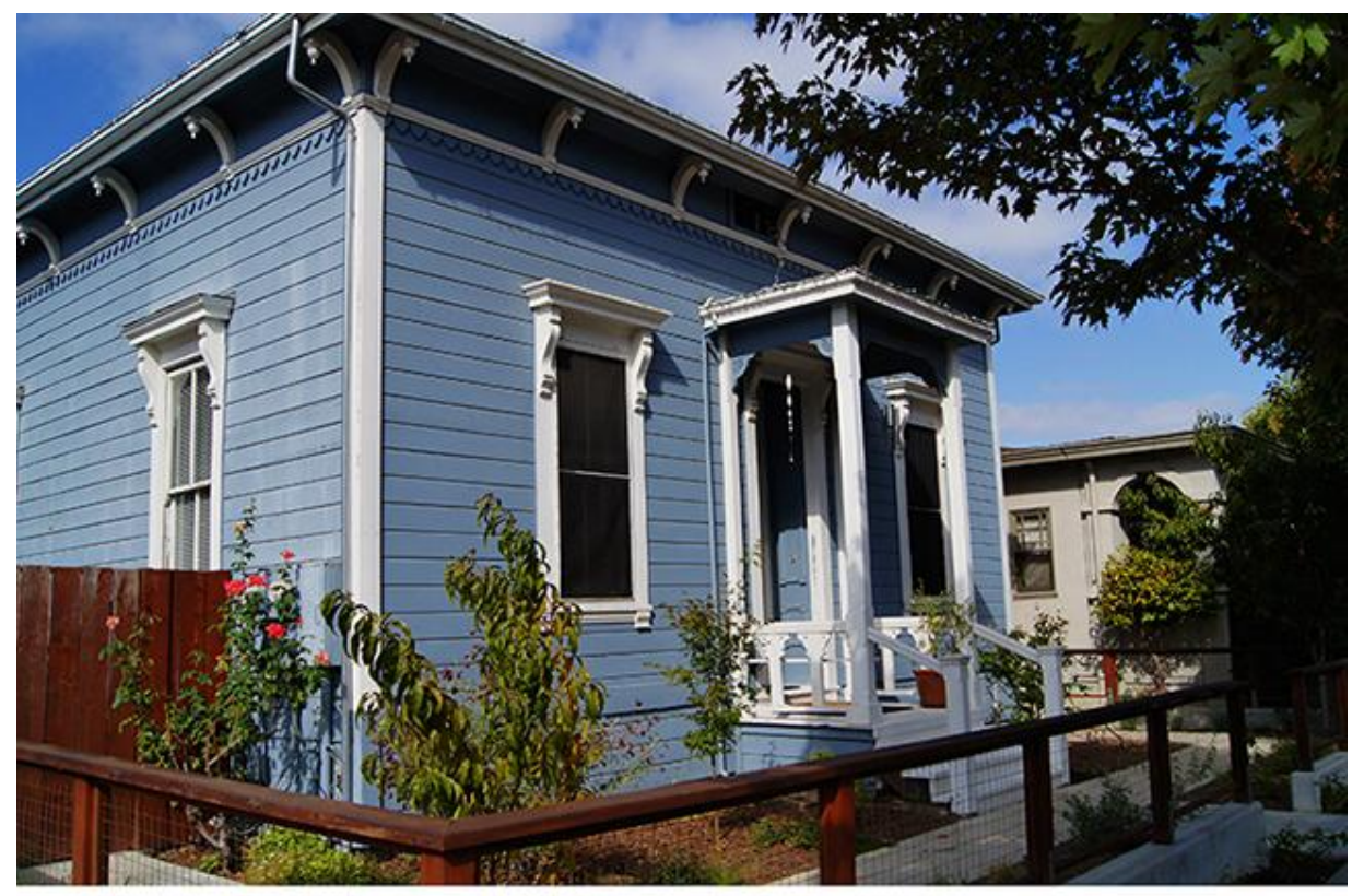
This 1870s Victorian home was the town house of a prosperous Reliez Valley farmer. It appears in the book "Martinez: A Handbook of Houses and History". It has been thoughtfully restored and retains its original wood floors and varnished paneling.