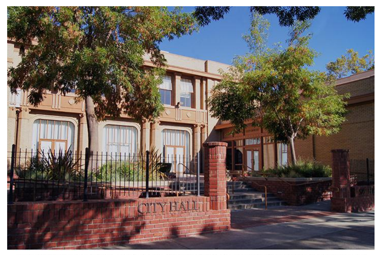
City Hall will be open for the Martinez Home Tour with a docent on site plus photo displays and historical information on the building. The structure began life as a public grammar school in 1917 to educate the children of the Shell OII employees working at the newly opened Refinery.

The Borland House is the location of the Martinez Museum which is operated by the Martinez Historical Society. The Borland Home will welcome visitors from 10 am to 4 pm on Saturday, October 13th, the day of the Martinez Home Tour.