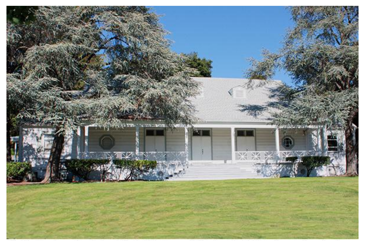
The Martinez Home Tour begins at the Shell Clubhouse which is located at 1635 Pacheco Boulevard on the edge of downtown Martinez. The Clubhouse still retains its 1937 Craftsmen interior, original woodwork (including ceiling beams, paneling and decorative details), light fixtures and hardware.