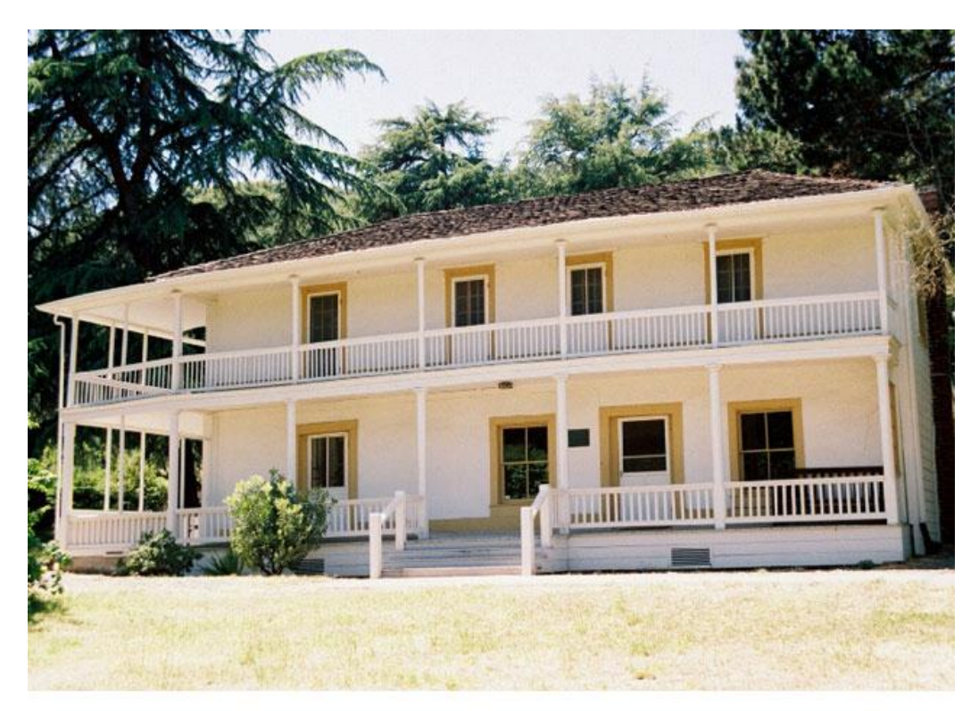
The Martinez Adobe is one of the small number of structures in California dating back to Statehood and beyond. Constructed circa 1849, the building has been seismically retrofitted, and should now last the ages. It is currently displaying the first full scale exhibit on the historic de Anza Trail.