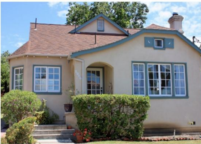
2009 Home Tour English Cottage — 1928 1010 Brown Street, Martinez