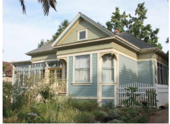
2009 Home Tour Queen Anne Cottage (Victorian) — 1898 1135 Susana Street, Martinez