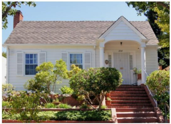
2013 Home Tour Colonial Revival — 1929 1204 Ulfinian Way, Martinez