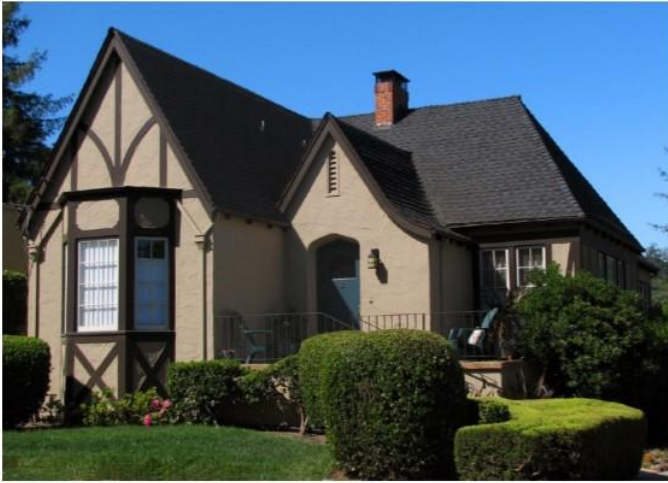
2008 Home Tour Tudor Revival — 1935 1700 Pine Street, Martinez CA